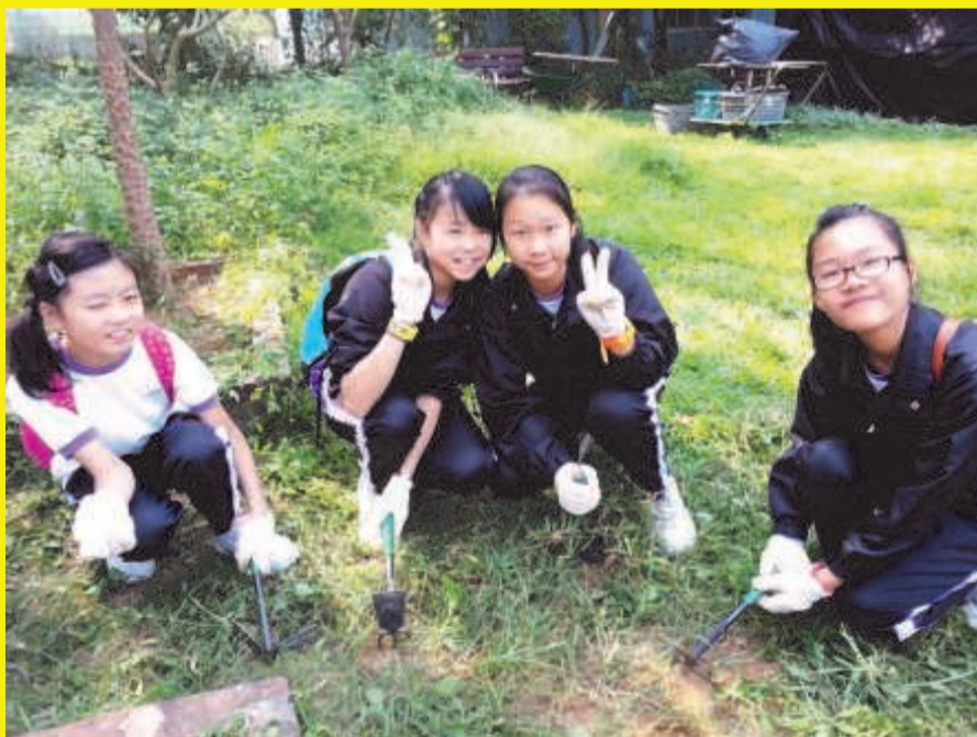
Some P6 students planting vegetables