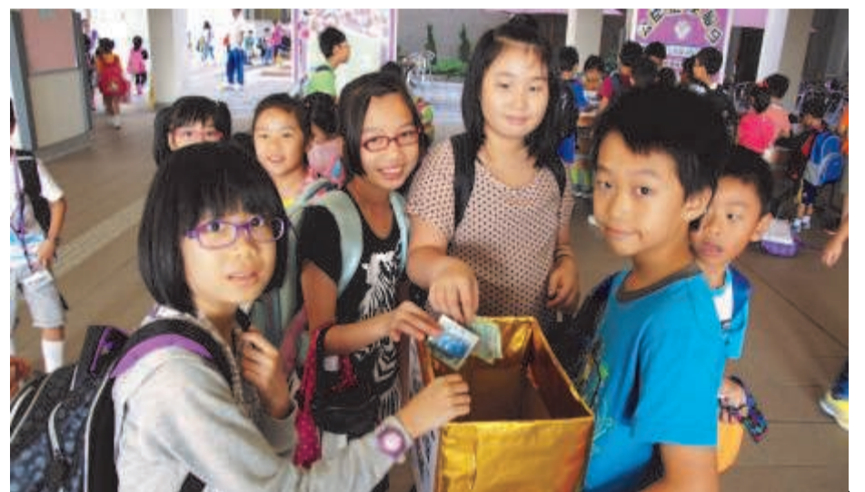
Students enjoy donating money to people in need