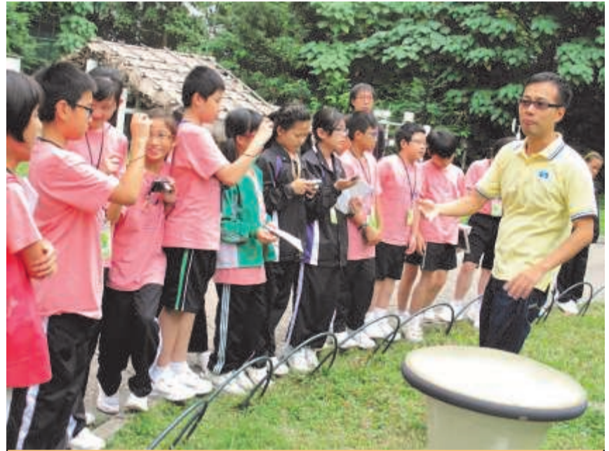
The Care Reporters learn about weather forecasting

All of the children felt very happy about this trip.