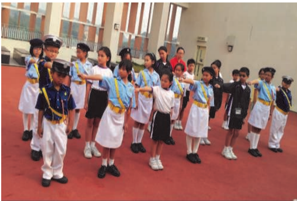
The Road Safety Patrol group practises

The students in the Road Safety Patrol meet every Monday after school for one hour. There are about 50 students in the group and they need to wear the Road Safety Patrol's uniform.