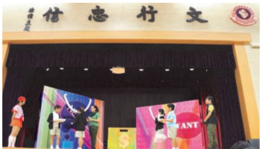
Lee Kam students learn the difference between "need" and "want"

The moral of this play is that you should always use your Octopus card correctly.